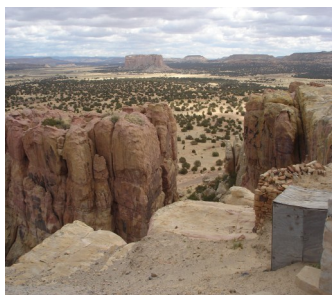
View of the New Mexico desert from Sky City

De-cluttering is the first step in reclaiming your energy and getting out from under feeling overwhelmed. Taking the first step is the hardest. But once you