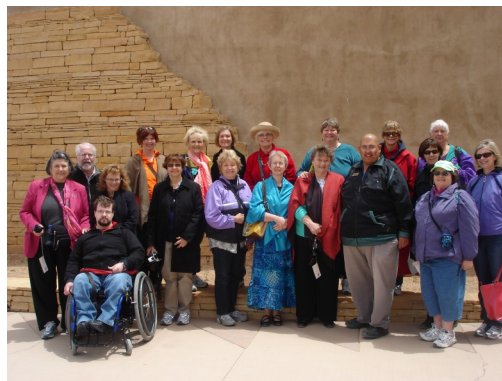
Participants in the MRM 2011 Retreat

spring newsletter. We met during the SAMRM Retreat in May. (You will be hearing more about the retreat.) The committee reviewed the survey, identified work that needs to be done, and set goals for the next few months.