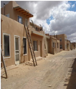
Acoma Pueblo Sky City, NM