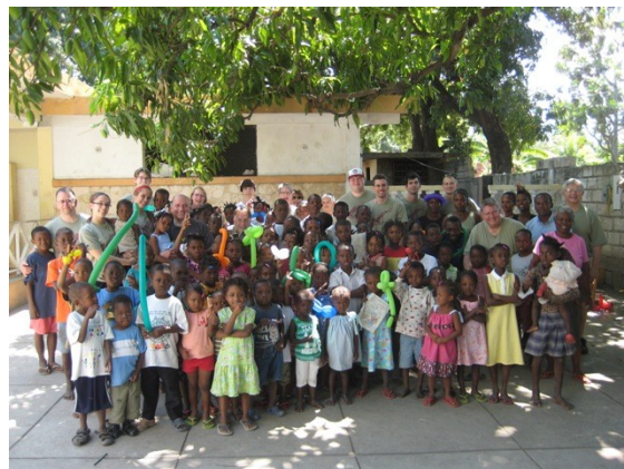
Mission team members with children at an orphanage in Port au Price

Thanks to all who have completed the online SARAM survey. The survey is still up, so please take a moment to complete the survey if you haven't already done so. http://www.surveymonkey.com/s/YGLRF3G